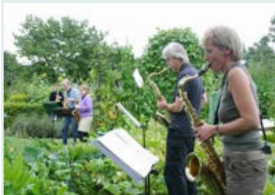
Image 8 - Music session in a vegetable plot of the Langemarck allotment gardens, Münster, Germany.