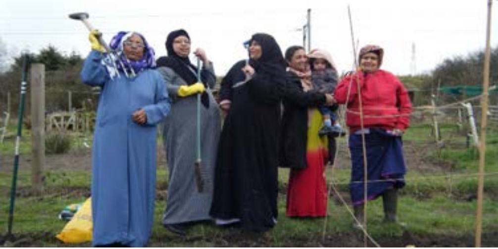
Image 6 - Bangladeshi women prepare their garden plots, Ipswich, UK.