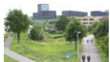
Photos 9 & 10: The allotment garden site "Park Groenewoud" in Utrecht, Netherlands.