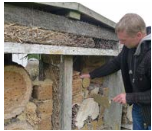
Image 7 - Gardeners provide nest sites for wild bees.