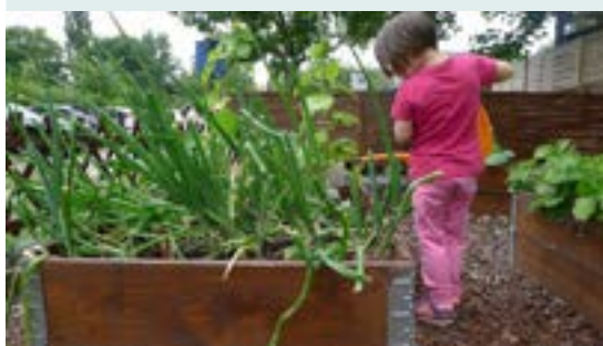
Image 5 - Young gardeners in action.