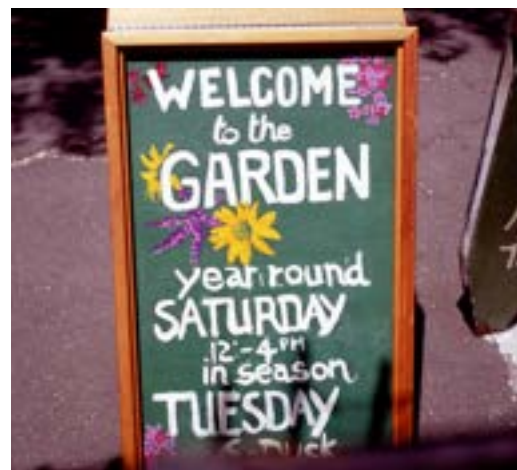
Image 3 - Garden Park Groenewoud (De Hoge Weide), Utrecht, The Netherlands.