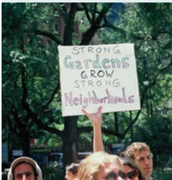
Image 4 - Protesters demonstrate against bulldozing of community gardens in New York City.