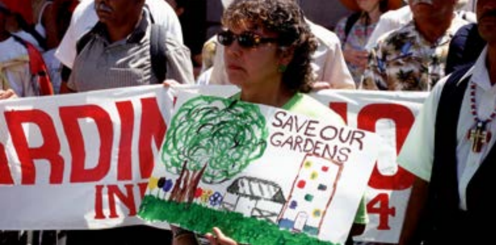
Image 2 - Protesters against bulldozing of community gardens in New York City.