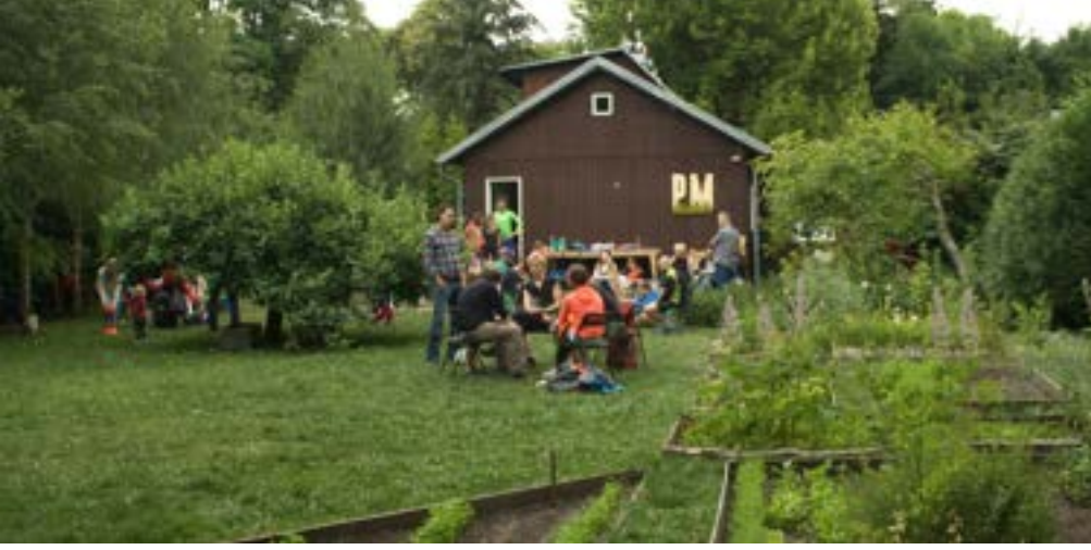
Image 4 - Summer garden party, Queen Bona Community Garden, Jazdów, Warsaw.