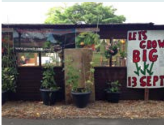
Image 7 - Providing communal space for social events and shared activities, Walsall Road Allotment.