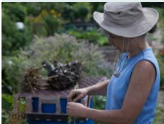
Image 6 - "I like to grow things in clumps ... and I mix stuff ... unusual stuff ... it looks better, it looks more natural ... like a forest or a wild field", (Plot-holder at Walsall Road Allotment). Photo: Susan Noori (picture taken with permission for public use)