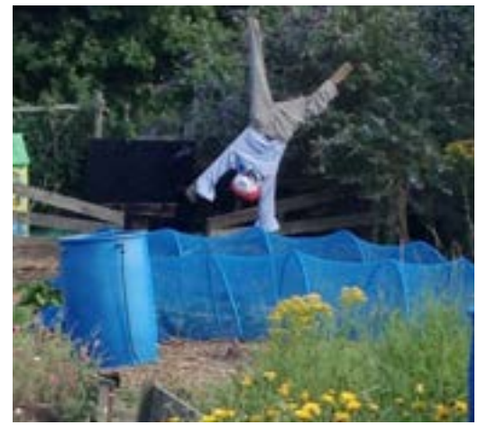
Image 3 - Personalising plots, Moor Green Allotment, Birmingham.