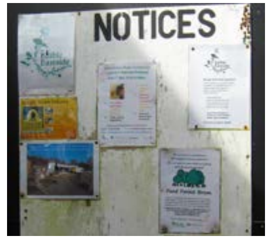
Image 5 - Notice board for sharing information, Edible Eastside, Birmingham.