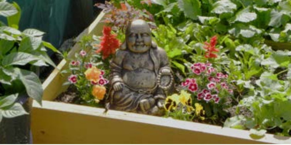
Image 2 - Personalising plots, Weaver's Square Allotments and Community Garden, Dublin.