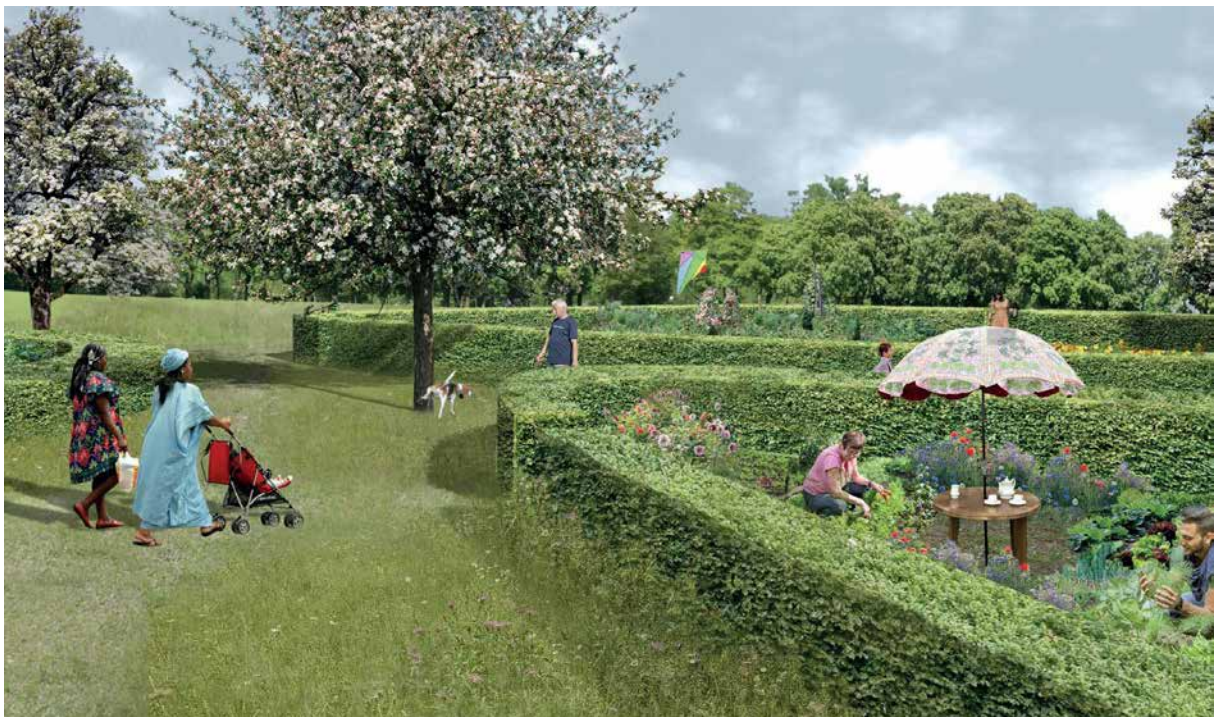
Garden land "Viererfeld/Mittelfeld" – visualization: Raderschall Landschaftsarchitekten AG, Meilen (winning team "VIF! Idea contest for urban planning Viererfeld Mittelfeld")

The following considerations for the direction of our family garden movement are based on direct experience and impressions in the Swiss environment. The extent to which these are transferable in whole or in part to other European countries must be assessed there.